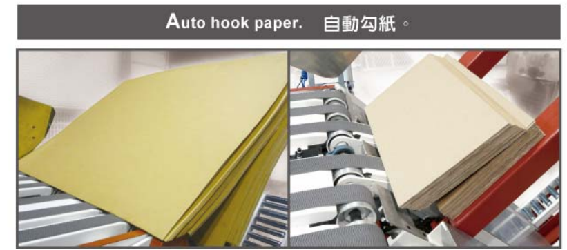
Auto hook paper. 自動勾紙。